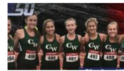
MileSplit Illinois 50 Week Four Rankings: 9/11